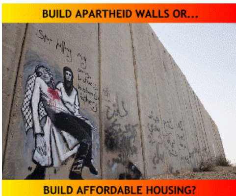
Graphic from new aidtoisrael.org website.

Challenging military aid to Israel. In February 2010, the US Campaign launched a new website— www.aidtoisrael.org —that highlights the moral and budgetary costs of the United States providing Israel with $30 billion in military aid between 2009-2018. An interactive map on the website displays how much money each city, Congressional district, and state provides in military aid to Israel, and what that money could fund instead for unmet domestic needs such as affordable housing, health care, green jobs, and education. The US Campaign advertised the website on Google and Facebook, resulting in 6.5 million people seeing the ads, and thousands of people going to the website.