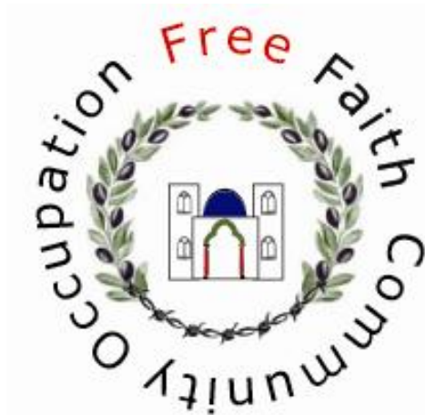
OFFC is a new US Campaign initiative to encourage BDS in faith communities.

Faith Organizing. The US Campaign continued its efforts to reach out to faith communities and encourage them to engage in BDS campaigns. The US Campaign gave dozens of speeches, workshops, and presentations at congregations both to educate them about U.S. policy toward Palestine/Israel and to encourage them to take steps to make sure that their congregations are not complicit with Israel's illegal military occupation of the Palestinian West Bank, East Jerusalem, and Gaza Strip, and Israel's human rights abuses of and apartheid policies toward Palestinians.