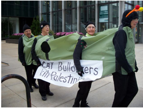
US Campaign member group Peace Action-Wisconsin protests CAT in Milwaukee.

to illegal Israeli settlements—at Citi Field, and helped organize or joined successful calls to artists such as The Pixies and Gil Scott Heron to cancel performances in Israel.