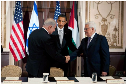
The US Campaign produced analyses and advocacy campaigns on policy issues.

In March 2010, the US Campaign partnered with member group Interfaith Peace-Builders to organize the second Grassroots Advocacy Training/Lobby Day , which drew approximately 200 participants from almost 30 states with nearly 70 Capitol Hill meetings taking place. On the first day of the event, participants attended panels and workshops designed to increase their knowledge of and skills about how to change U.S. policy toward Palestine/Israel to support human rights, international law, and equality. The next day, participants went to meetings on Capitol Hill to press their Members of Congress for accountability on military aid to Israel, an end to Israel's illegal blockade of the occupied Palestinian Gaza Strip, and investigations into the tax-status of non-profit organizations funneling money to illegal Israeli settlements in the occupied Palestinian West Bank and East Jerusalem.