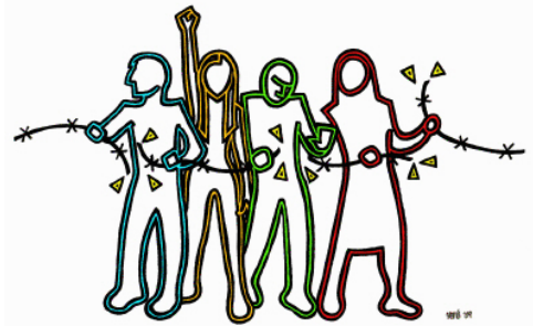
The US Campaign participated in the Hampshire BDS conference.

efforts on college campuses across the country. The US Campaign created a special web section devoted to campus BDS organizing, which features a 33-page handbook for student divestment initiatives , entitled “Divest Now!” in addition to a series of PowerPoint presentations guiding students through the BDS process on campus. The US Campaign also organized two campus BDS organizing tours in Fall 2009 and Spring 2010. In Fall 2009, the US Campaign organized BDS conferences on campuses in Milwaukee and Pittsburgh and gave workshops at the Hampshire College Students for Justice in Palestine BDS conference. In Spring 2010, the US Campaign organized BDS trainings on campuses in New Mexico and Arizona , and gave a workshop on BDS at the Campus Antiwar Network's National Conference at the University of Illinois, and in Washington, DC. In addition, the US Campaign trained student activists at Eastern Mennonite University (EMU), which resulted in a Mennonite university-wide divestment initiative. The US Campaign also publicly supported the BDS efforts of the students at the University of California—Berkeley through an email advocacy campaign.